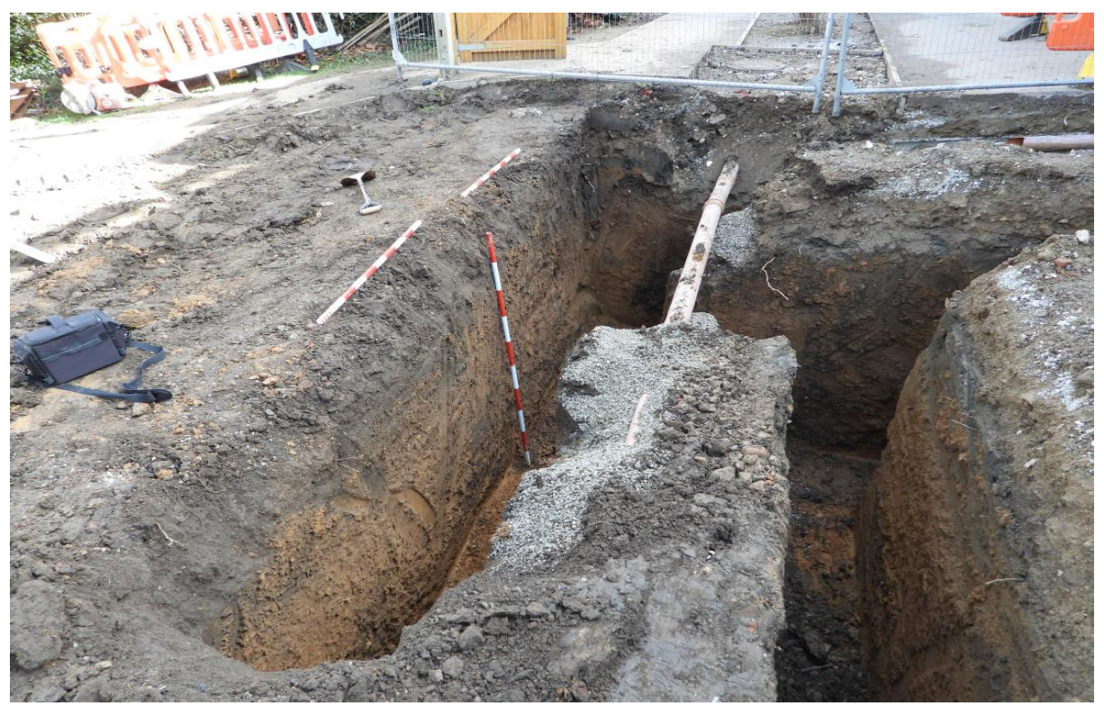
Plate 7: Showing exposed geology and plastic pipe in foundation trenches excavated at northern side of the pavilion. Looking northeast with one two-metres and two one-metre scales.