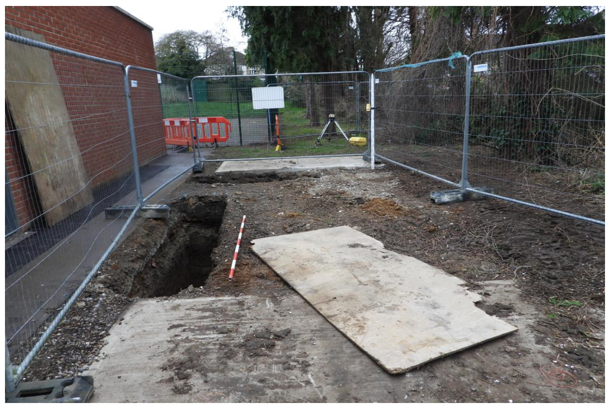
Plate 5: Further foundation trench excavated at western side of the pavilion. Looking south with two-metre scale.