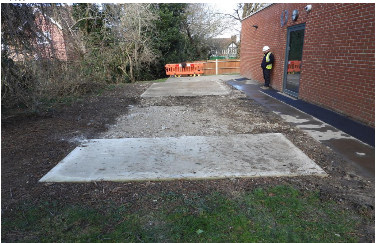
Plate 1: Showing the site. Western side of the pavilion prior the the commencement of groundworks, looking north.