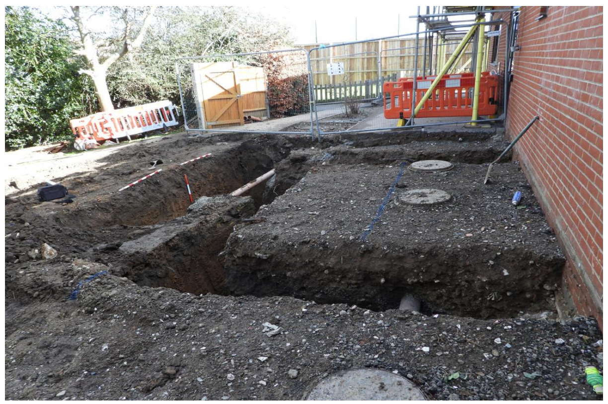
Plate 6: Showing staircase foundations at northern side of the pavilion. Looking east with one two-metres and two one-metres scale bars.