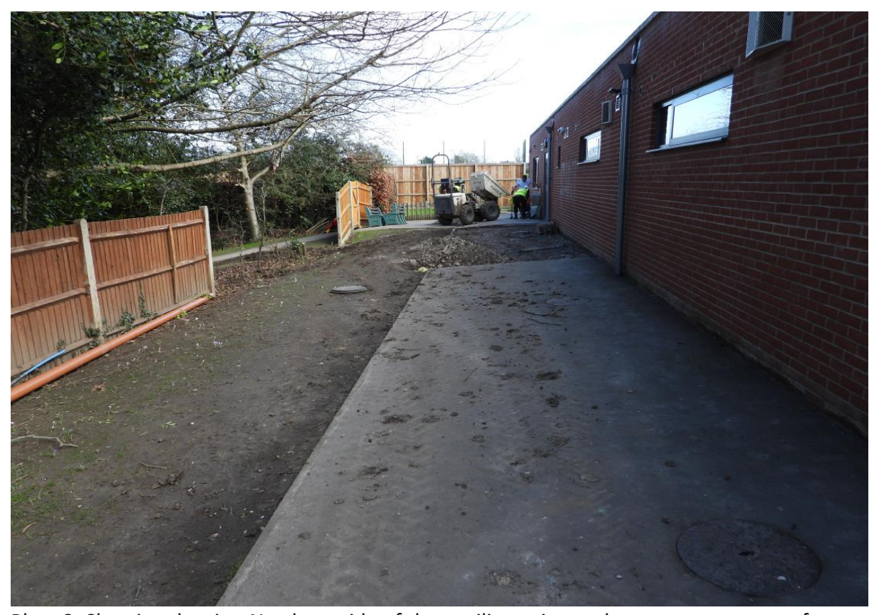
Plate 2: Showing the site. Northern side of the pavilion prior to the commencement of groundworks, looking east.