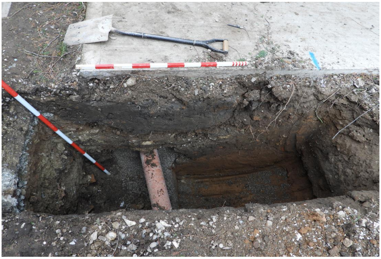
Plate 4: Showing plastic drain exposed in foundation trench at western side of the pavilion. Looking south with one- and two-metres scales.