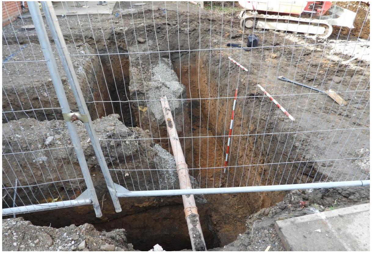
Plate 8: Viewing northern foundations from the east. One two-metres and two-one metre scales.