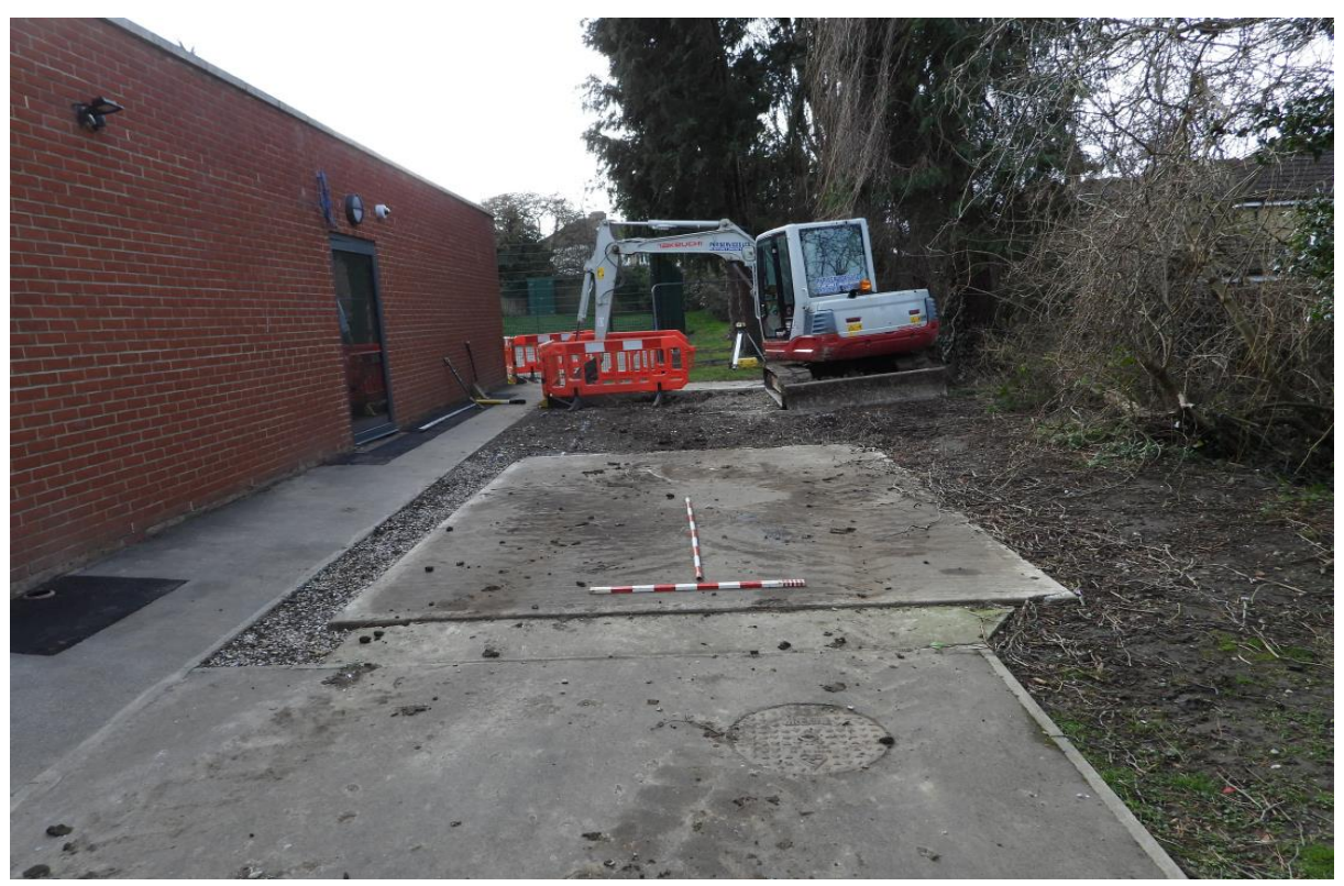
Plate 3: Excavations at western side of the pavilion. Looking south with one- and two-metres scales.